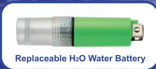
Replaceable H2O Water Battery

The H2O Multifunction Clock is the most unique powered product anywhere in the world today. By just adding water you are providing your product with an endless source of energy. At the end of the H2O water battery's life (indicated by dimming of the display) simply replace the battery and start all over again.